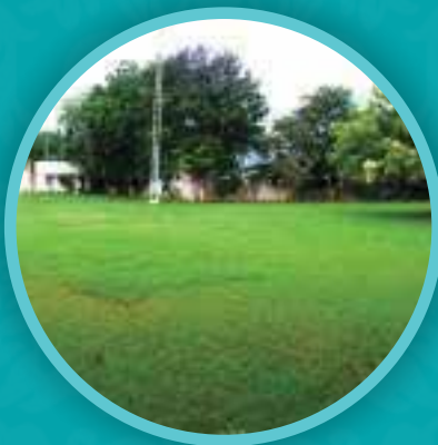
DEDICATED COMMON PLOT & PARTY LAWN