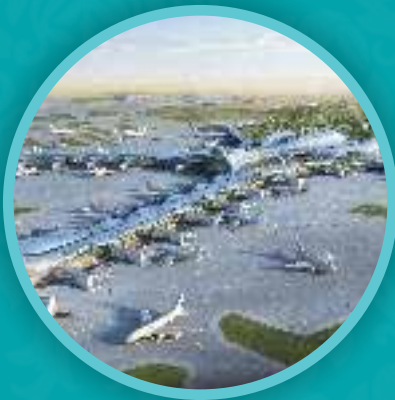
INTERNATIONAL CARGO AIRPORT