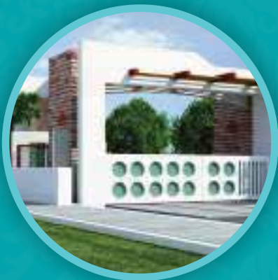
ATTRACTIVE ENTRANCE GATE

We welcome you to participate in the growth story of Gujarat ! Come, be a part of one of the first 5 Smart Cities of India and register yourself for being one of the first WEALTHIEST!!