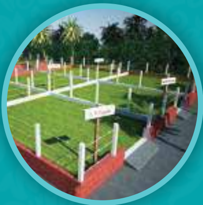
INDIVIDUAL PLOT MARKING