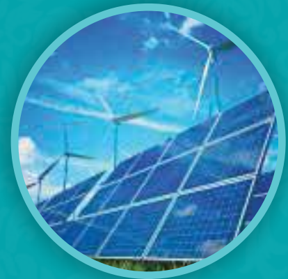
WIND & SOLAR ENERGY