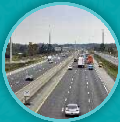
SIX LANE EXPRESS WAY