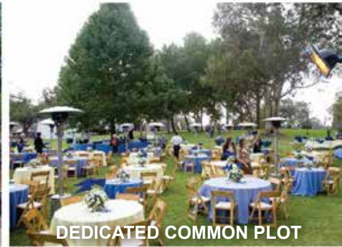
DEDICATED COMMON PLOT