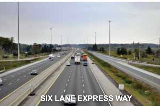
SIX LANE EXPRESS WAY