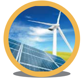
Wind & Solar Energy