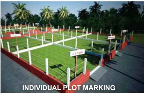
INDIVIDUAL PLOT MARKING