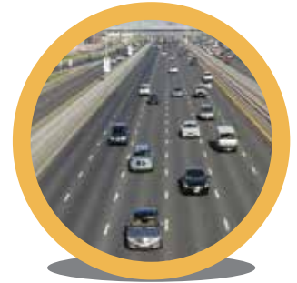
Six Lane Expressway