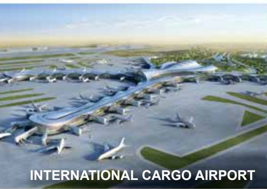
INTERNATIONAL CARGO AIRPORT