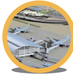
International Cargo Airport