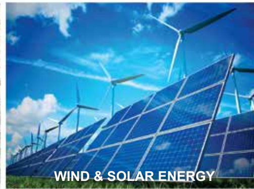
WIND & SOLAR ENERGY