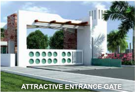
ATTRACTIVE ENTRANCE GATE